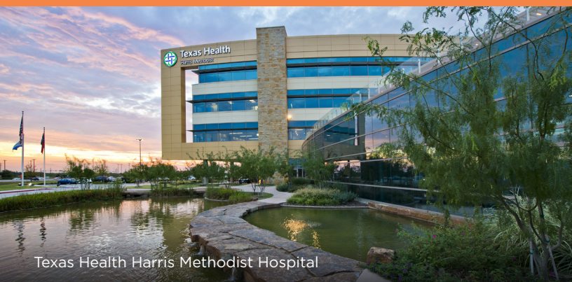
Texas Health Harris Methodist Hospital