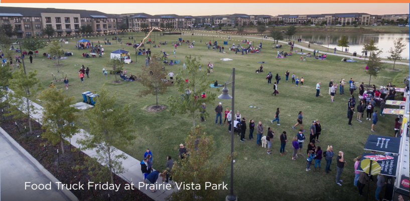
Food Truck Friday at Prairie Vista Park