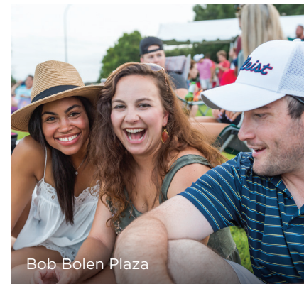
Bob Bolen Plaza