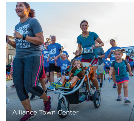
Alliance Town Center