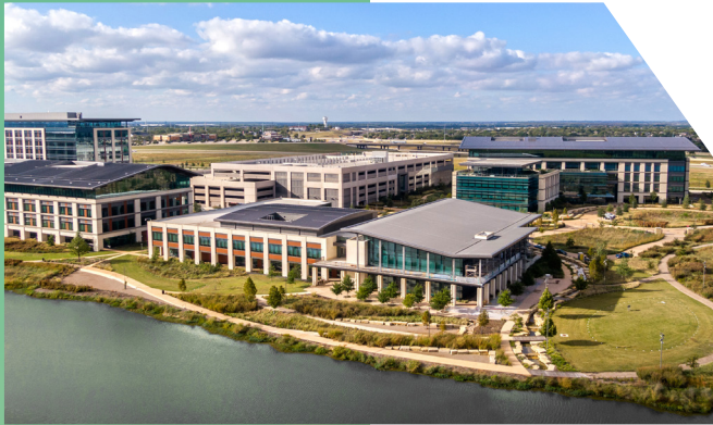
Charles Schwab, Circle T Ranch®