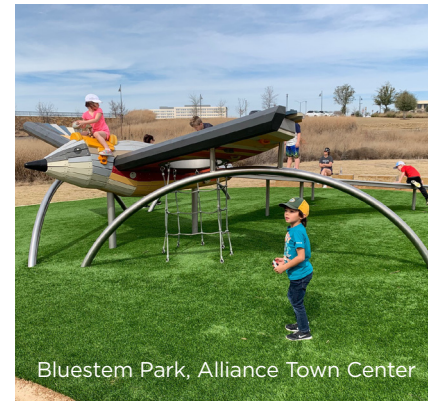
Bluestem Park, Alliance Town Center

From outdoor, live entertainment to fun runs, aviation-focused and charity events, the region is bustling with activities for the whole family.