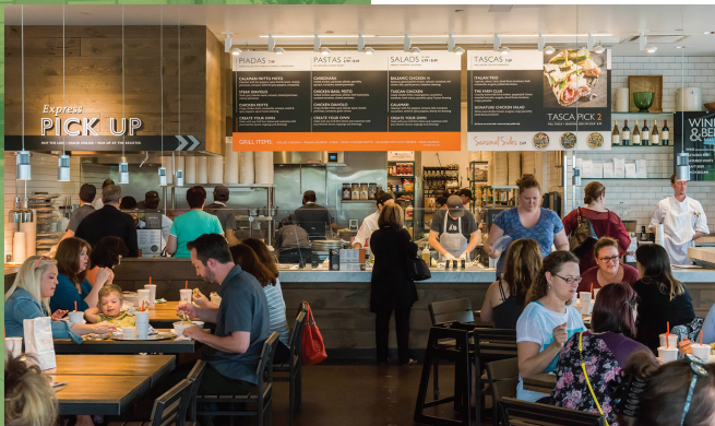
Piada, Alliance Town Center