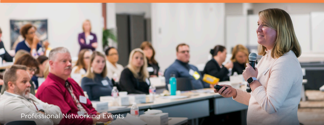
Professional Networking Events