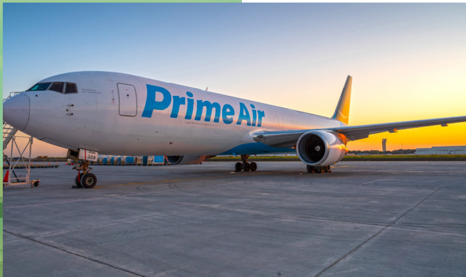
Amazon Air, Alliance