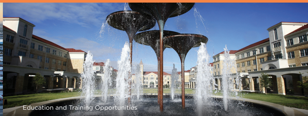
Education and Training Opportunities