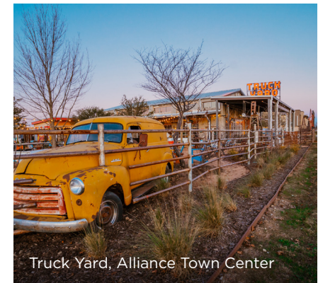
Truck Yard, Alliance Town Center