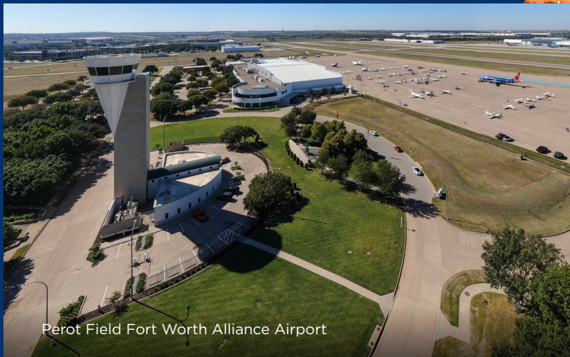
Perot Field Fort Worth Alliance Airport

Perot Field Fort Worth Alliance Airport, the foundational core at AllianceTexas, is the product of a unique partnership between the visionaries at Hillwood, the city of Fort Worth and the Federal Aviation Administration (FAA). The term “Alliance” best characterizes the cooperative spirit between private and public entities that created this dynamic region.