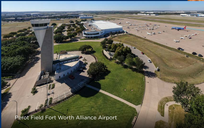
Perot Field Fort Worth Alliance Airport

Perot Field Fort Worth Alliance Airport, the foundational core at AllianceTexas, is the product of a unique partnership between the visionaries at Hillwood, the city of Fort Worth and the Federal Aviation Administration (FAA). The term “Alliance” best characterizes the cooperative spirit between private and public entities that created this dynamic region.