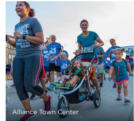
Alliance Town Center