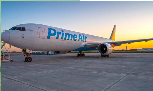
Amazon Air, Alliance