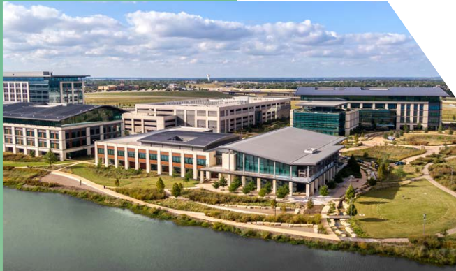
Charles Schwab, Circle T Ranch®

Perot Field Fort Worth Alliance Airport delivers world-class executive travel services, military support solutions and enables global transportation for air cargo and logistics pioneers.