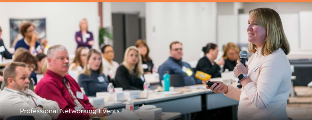
Professional Networking Events