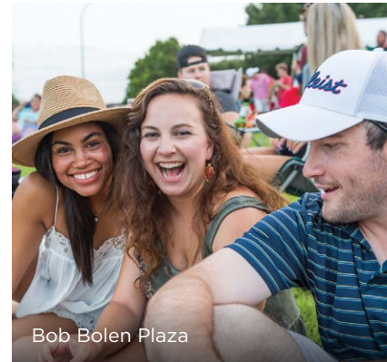
Bob Bolen Plaza