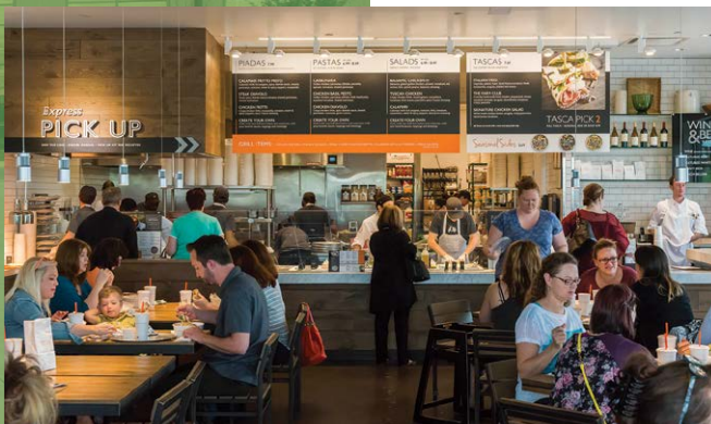
Piada, Alliance Town Center