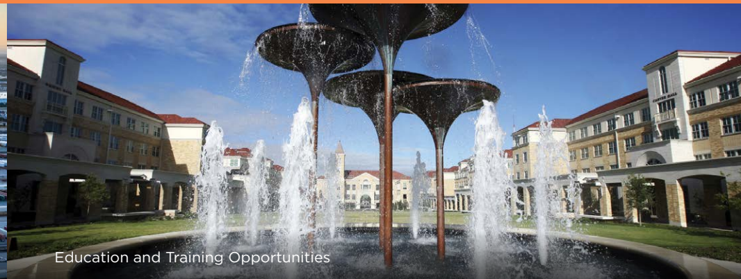
Education and Training Opportunities

One of the world's premier inland ports, AllianceTexas is home to a unique set of air and ground assets including Perot Field Fort Worth Alliance Airport, BNSF Intermodal Hub, and 162 miles of roadways.