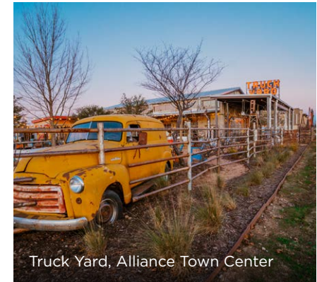
Truck Yard, Alliance Town Center