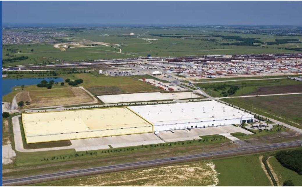
1200 Intermodal Parkway, Fort Worth, Texas 76177, Tarrant County