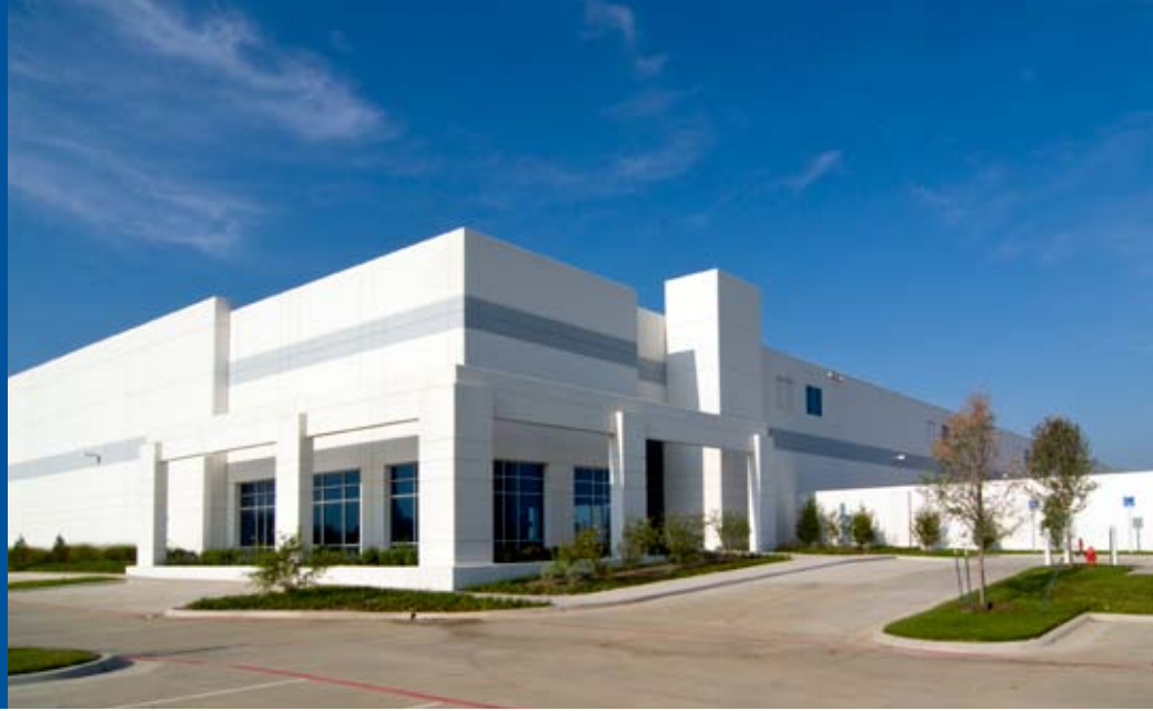
4798 Henrietta Creek Road, Fort Worth, Texas 76177, Denton County

A DEVELOPMENT OF HILLWOOD A PEROT COMPANY™