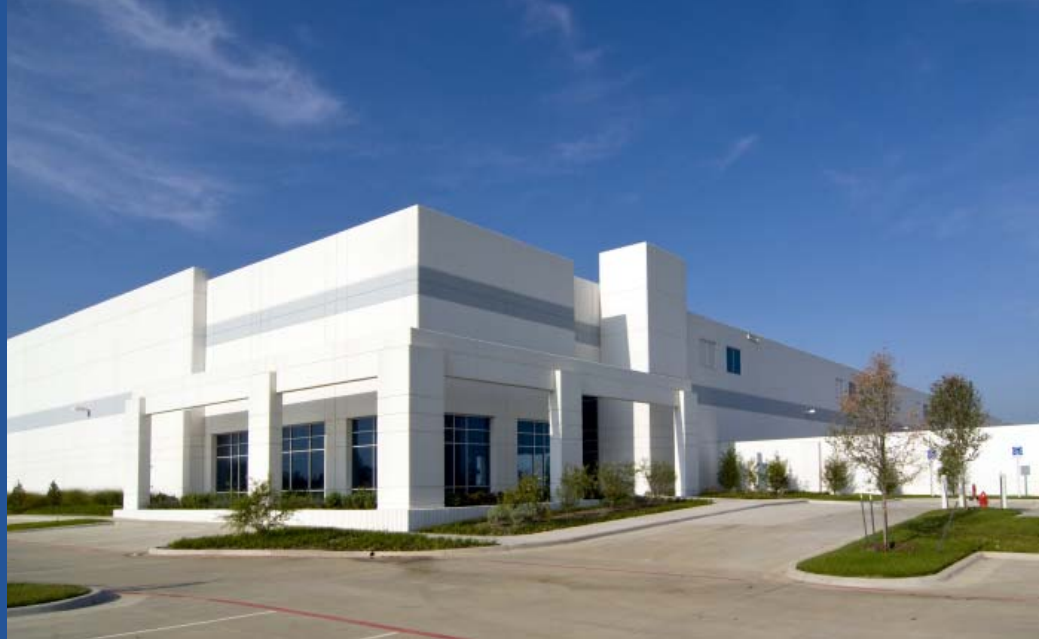
4798 Henrietta Creek Road, Fort Worth, Texas 76177, Tarrant County

A DEVELOPMENT OF HILLWOOD A PEROT COMPANY™