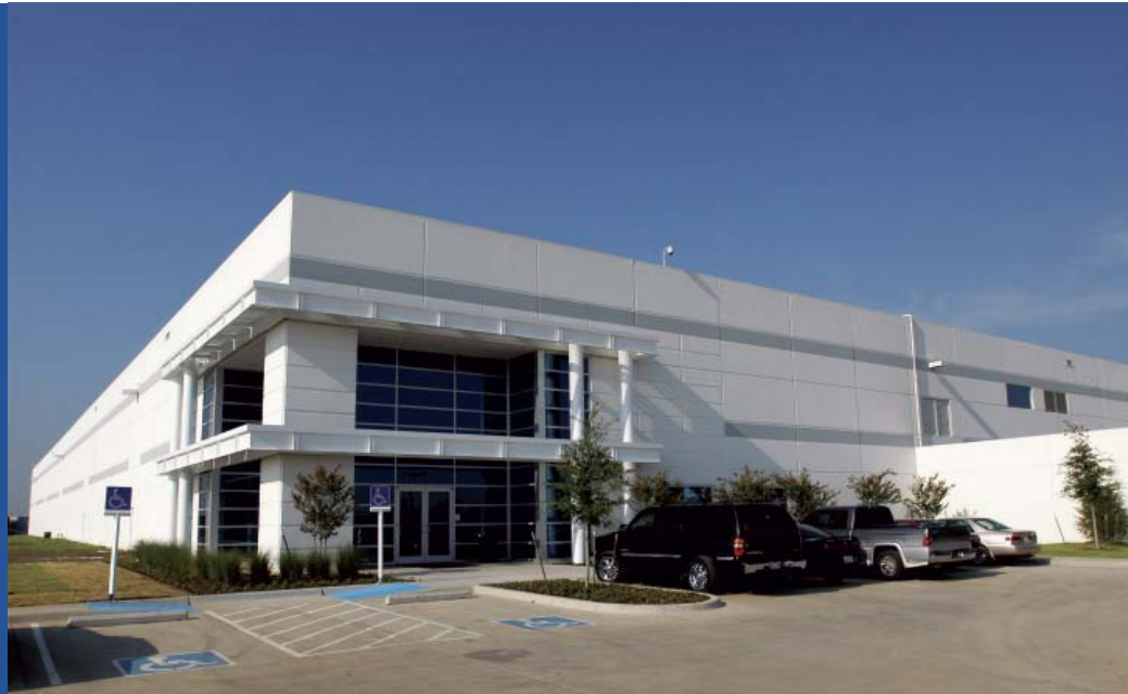
501 Henrietta Creek Road, Roanoke, Texas 76262, Denton County