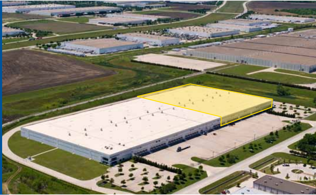
501 Henrietta Creek Road, Roanoke, Texas 76262, Denton County

A DEVELOPMENT OF HILLWOOD A PEROT COMPANY™