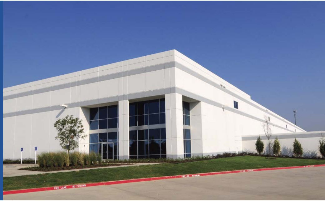
5001 Henrietta Creek Road, Fort Worth, Texas 76177, Denton County

A DEVELOPMENT OF HILLWOOD A PEROT COMPANY™