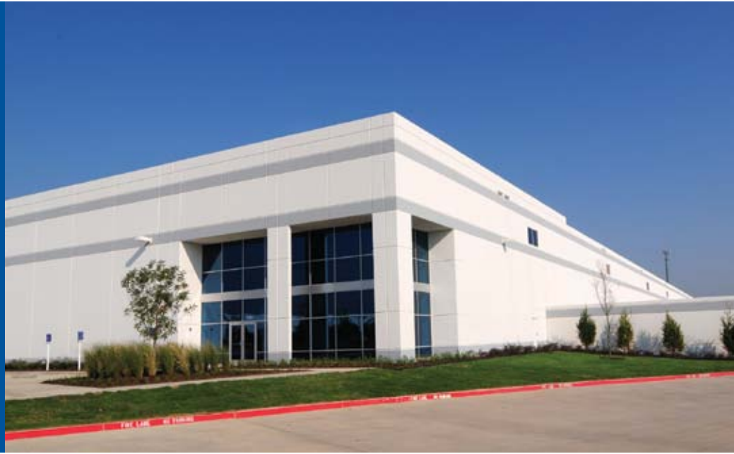
5001 Henrietta Creek Road, Fort Worth, Texas 76177, Denton County

A DEVELOPMENT OF HILLWOOD A PEROT COMPANY™