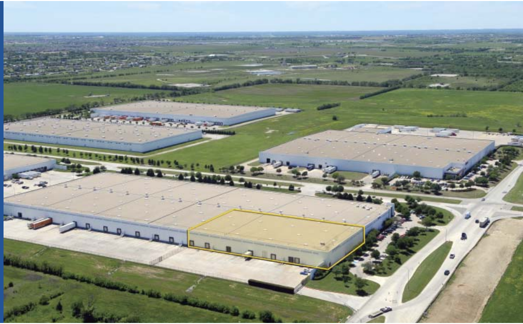
920 Westport Parkway, Haslet, Texas 76177, Tarrant County

A DEVELOPMENT OF HILLWOOD A PEROT COMPANY SM